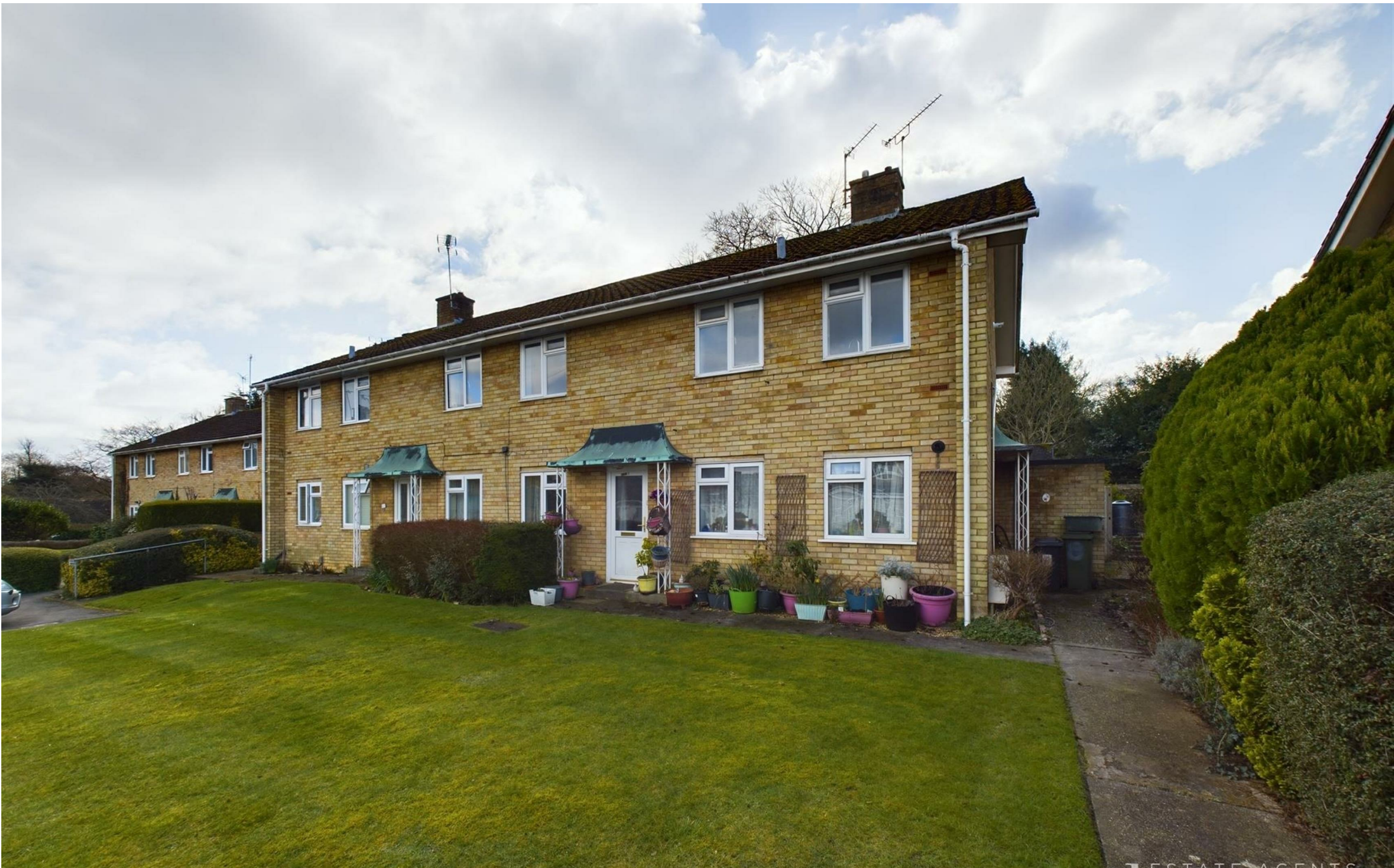
Montague Place, Fairfield, Basingstoke, RG21 3DS